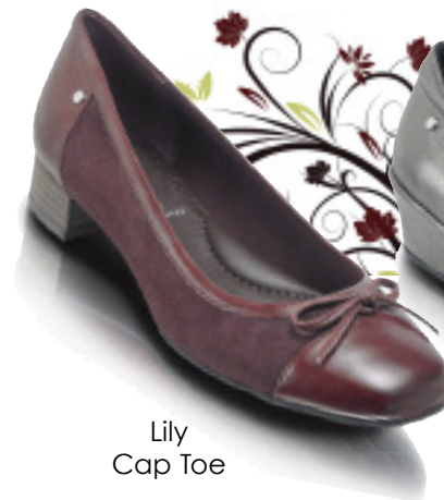
Lily Cap Toe