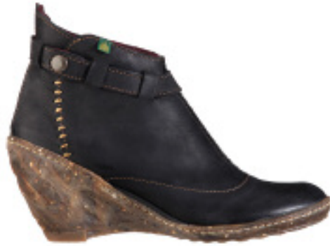
N484 in Ebano

El Naturalista believes that human beings are Earth's most valuable resource, therefore social responsibility is a fundamental pillar of our corporate philosophy. We avoid toxic processes and materials, and we practice conservation by using substances that are biodegradable and recyclable. Handcrafted. Inspired by nature. Eco-friendly. Leave a smaller footprint with El Naturalista.