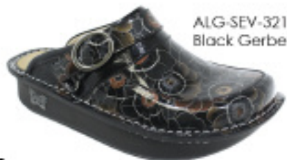
ALG-SEV-3211 Black Gerber