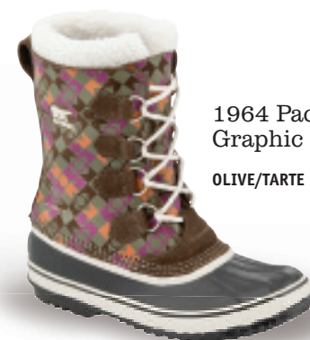
1964 Pac™ Graphic OLIVE/TARTE