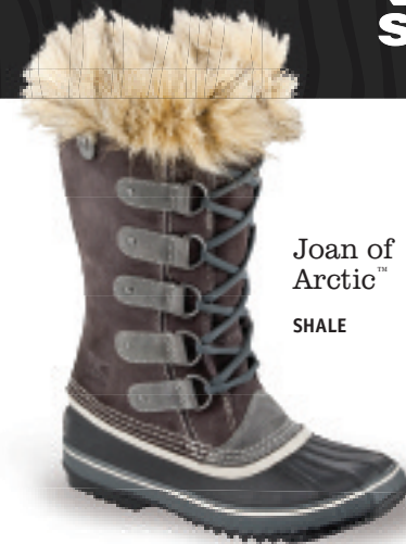
Joan of Arctic™ SHALE