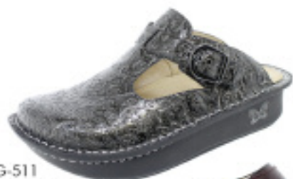
ALG-511 Black Tool Leather