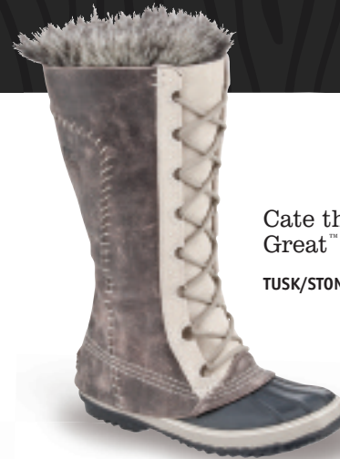
Cate the Great™ TUSK/STONE