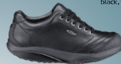
TATAGA black, w