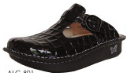
ALG-801 Black Croco Leather