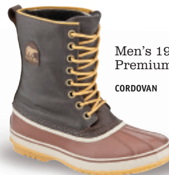
Men's 1964 Premium™ T CORDOVAN