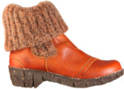
N097 in Skimo