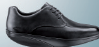
BOSI black, m