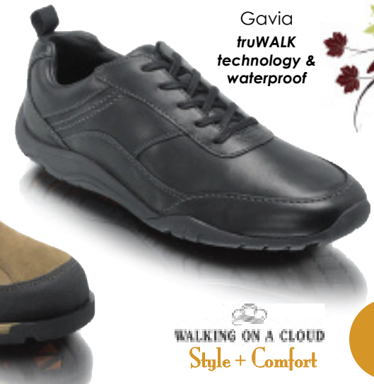
Gavia truWALK technology & waterproof