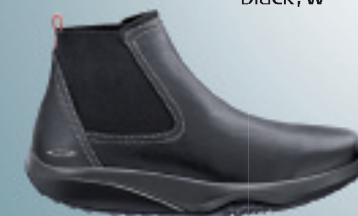
BOMOA black, w