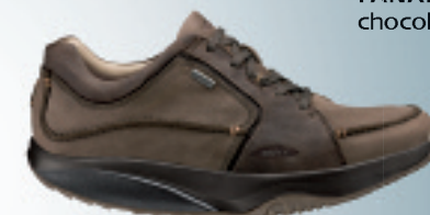
FANAKA GTX chocolate, m