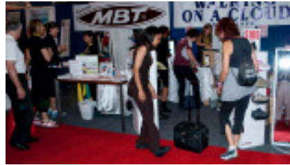
Walking On A Cloud and MBT team up at the CANFIT Pro Show in Toronto.

In the spring, we launched our Re-usable shopping bags. Not only are they great for the environment but a portion of all sales is donated to Breast Cancer Research.