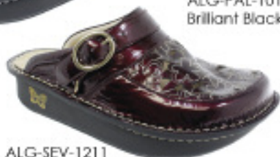
ALG-SEV-1211 Plum Open Daisy Patent