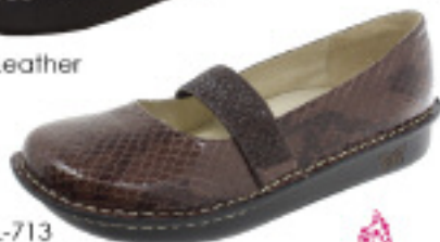
ALG-FEL-713 Choco Snake Patent