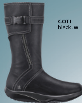
GOTI black, w