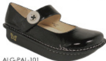
ALG-PAL-101 Brilliant Black Patent