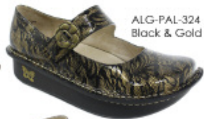
ALG-PAL-324 Black & Gold Lace