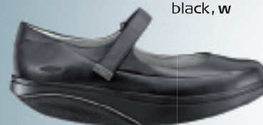
SIRIMA black, w