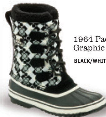
1964 Pac™ Graphic BLACK/WHITE